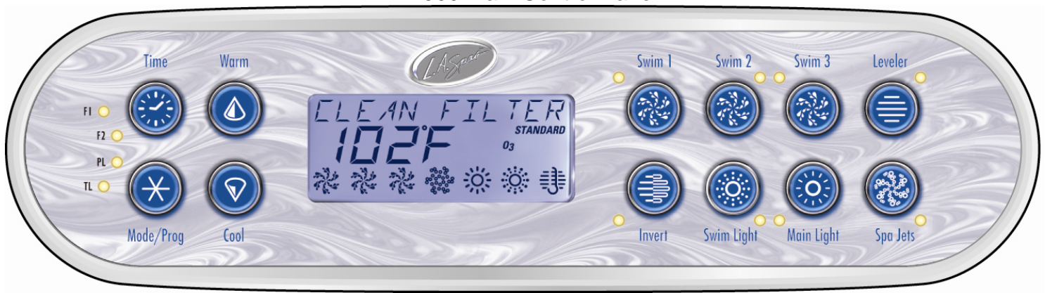
ML400 Auxiliary Control Panel